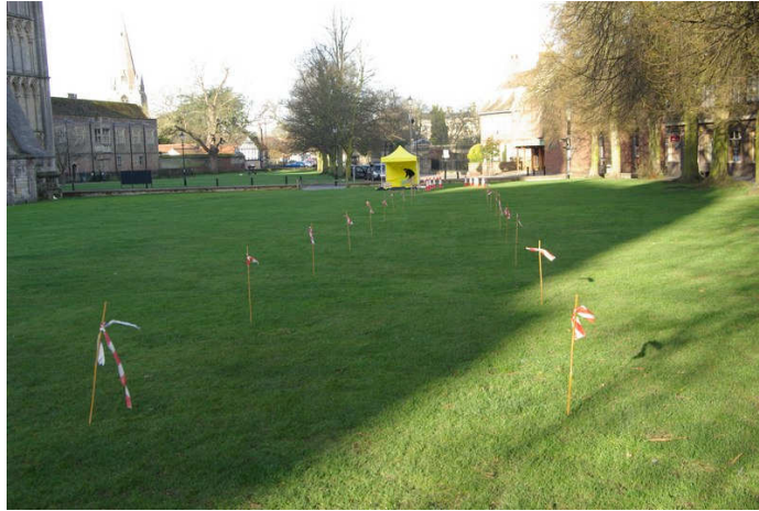
The multi-tasking finish funnel at the TTR