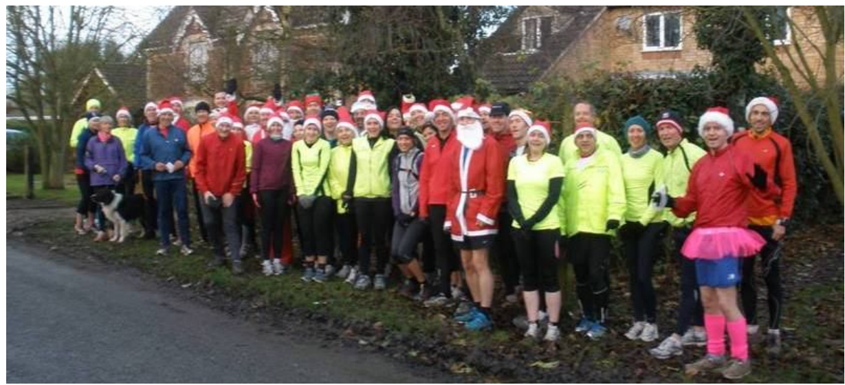
Ely Runners at the pre-Christmas run (Wood-Ditton) Sunday 9<sup>th</sup> December

If only chip times where kept it would mean not only that rankings would not be accurate and official but you would have anomalies where athletes finished ahead of other athletes in races would be ranked below them in the lists. As with most problems, if large amounts of money were available then 2 times could be entered. Of course by entering all qualifying ARC times, TOPS road rankings are much more accurate than those on Po10."